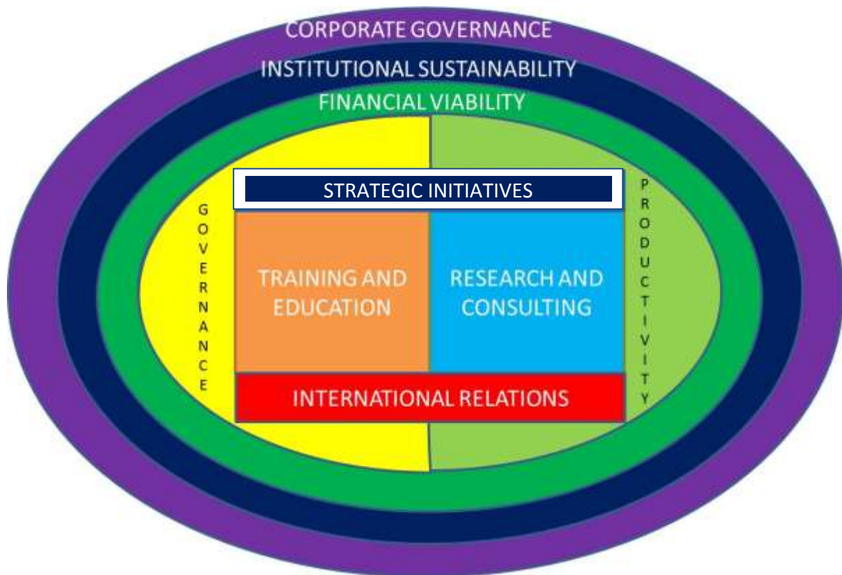
Figure 1. DAP Functional Model

The Functional model also provides insights into how DAP can best re-align the way it delivers its services to implement the strategic plan. Among the key considerations in the re-alignment of the way DAP can best set up itself are as follows: